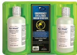
REW32D (Double 32oz Bottles)