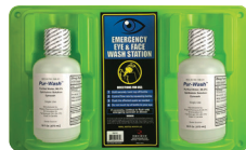
REW16D (Double 16oz Bottles)