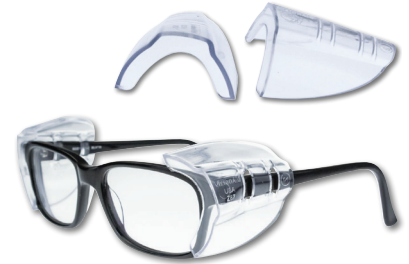
99705 Clear Lens