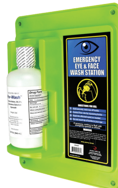
REW32S (Single 32oz Bottle)